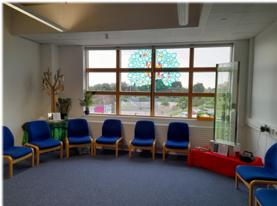
The 'Be Space' at the Oxford Academy School

sense of endorsement for chaplaincy in this school.