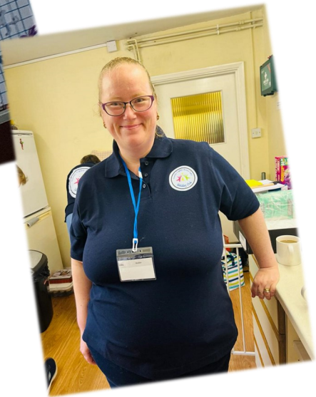
Some more pictures from the Holiday Club