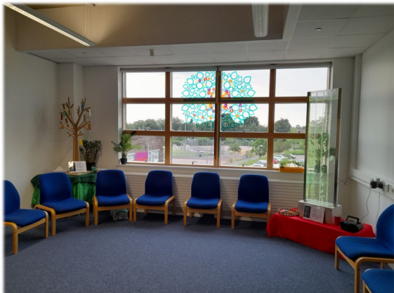
The 'Be Space' at the Oxford Academy School

sense of endorsement for chaplaincy in this school.